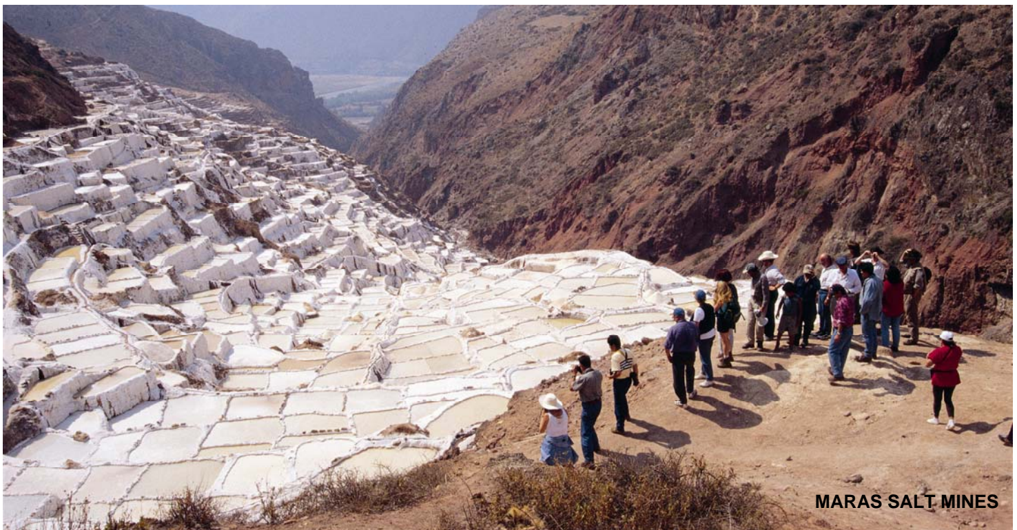
MARAS SALT MINES