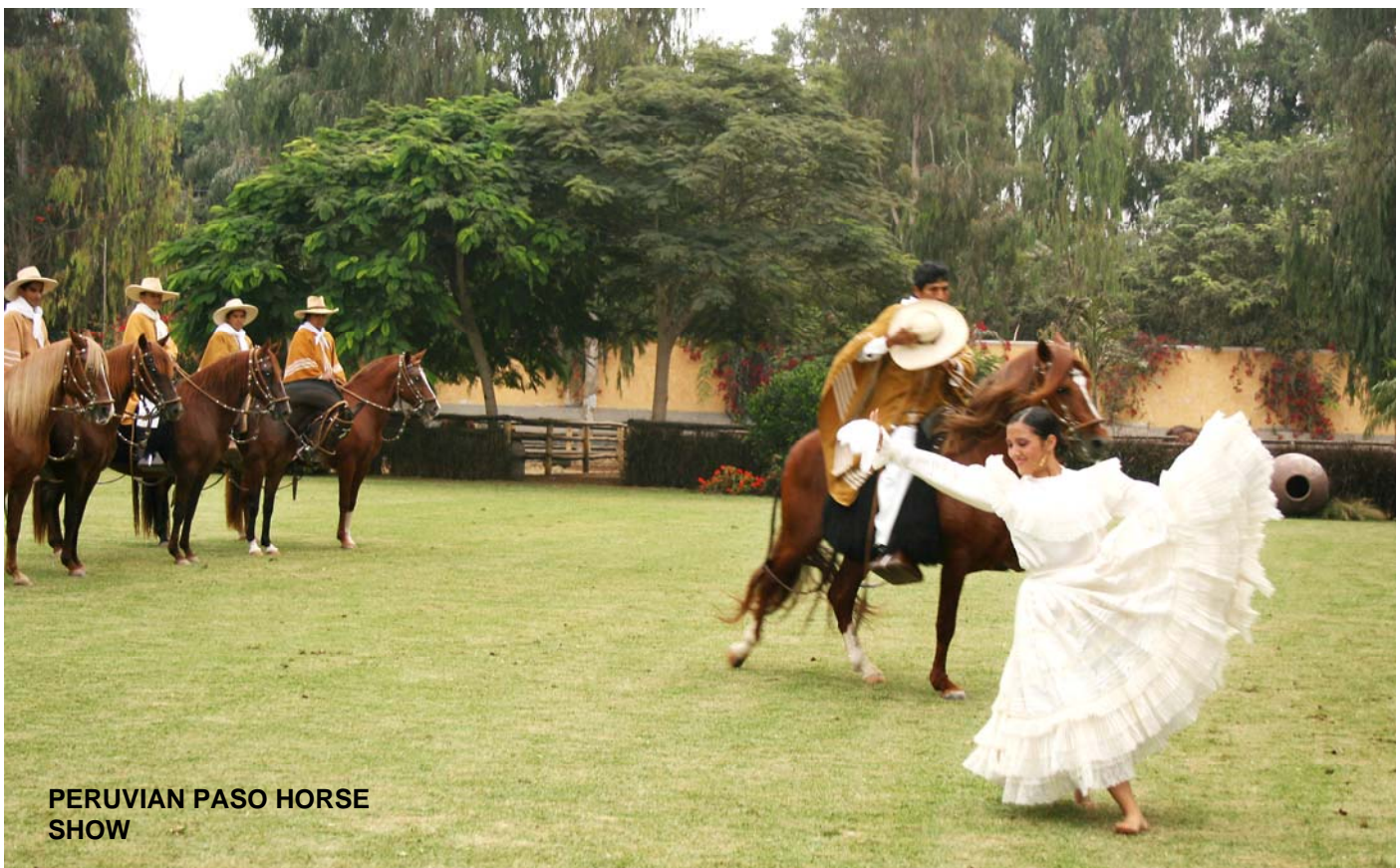
PERUVIAN PASO HORSE SHOW